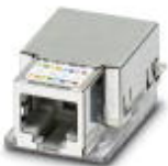
RJ45 socket insert, for the Freenet system, CAT5e, 8-pos., shielded, with cable connection (IDC fast connection), for solid wires AWG 24 ... 22

RJ45 female insert - VS-08-BU-RJ45-5-F/PK - 1652936