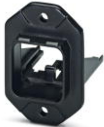
RJ45 panel mounting frame, IP67, for push-pull interlocking, plastic, with the Freenet system, for square panel cutout, with grommet, without mounting screws

Please be informed that the data shown in this PDF Document is generated from our Online Catalog. Please find the complete data in the user's documentation. Our General Terms of Use for Downloads are valid ( http://download.phoenixcontact.com )