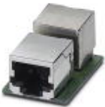
RJ45 socket insert, for the Freenet system, CAT5e, 8-pos., shielded, socket on socket

RJ45 female insert - VS-08-BU-RJ45-5-F/BU - 1652952